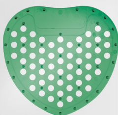
Green Pine/Pine BS-9G