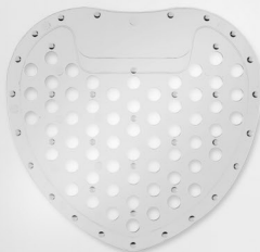
Clear/Tropical Fruit BS-6C